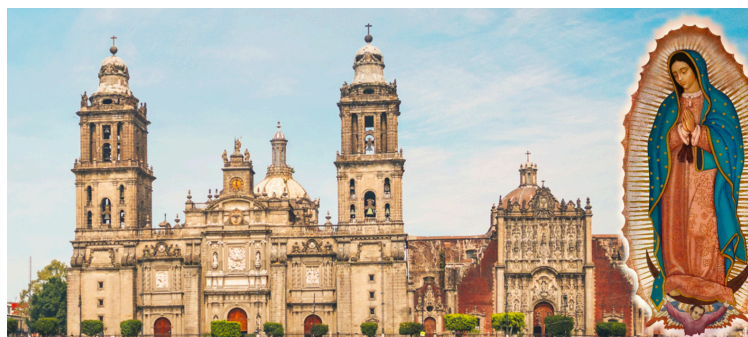
Pilgrimage to Our Lady of Guadalupe & the Cristero Saints of Mexico

Please visit our CD kiosk at the front of the church. We have many great topics on CD about the Catholic faith. We ask for a nominal donation of $3 for each CD.