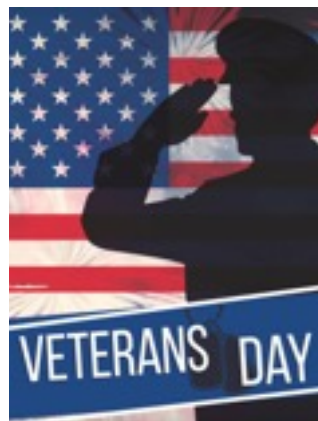
St. Martin of Tours, Pray for us!