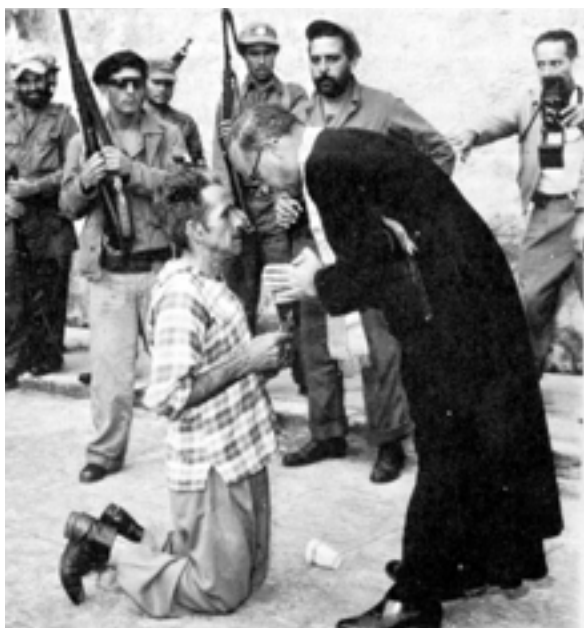
This picture won the Pulitzer prize in 1960. It shows a priest giving the last rites to a Cuban farmer, owner of his land. He refused to work for the Castro regime. He died by a firing squad after a "trial" by Che Guevara that lasted 4 minutes. You will never see this picture on a T shirt.